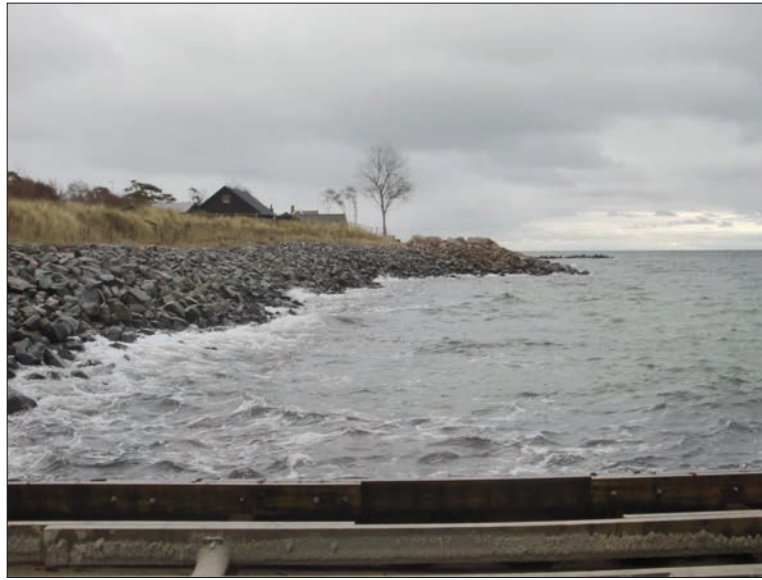
Figure 3. Examples of hard structures at the coast of Löderup (Photo: L. Bontje, November 2015).

These negative effects motivate the preferences regarding coastal protection gradually shifting from ‘hard’ solutions to ‘soft’ coastal defence techniques in most European countries (Hanson et al., 2002, Mulder et al., 2011, Hanley et al., 2014). This preference fits with the paradigm shift as explained by Stive et al. (2013): “Where in the past the challenge was formulated to ‘fight’ the forces of nature [with hard structures, red.], today’s approach recognizes many issues other than protection against flooding, especially the multiple ecological forces that have to be accommodated and can help the processes of protection.” (p.1002). The present coastal management approach of the municipality of Ystad emphasizes the natural processes of erosion and accumulation and combines the existing hard structures with new soft solutions (2008a) – fitting the new paradigm.