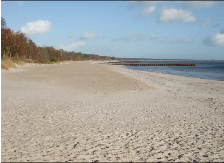
Figure 4. ( Nourished ) beach and groyne at Ystad Sandskog (Photo L. Bontje, November 2015).

ishments in 2013: the application was approved based on existing laws without even a court hearing (Land and Environmental Court, 2013).