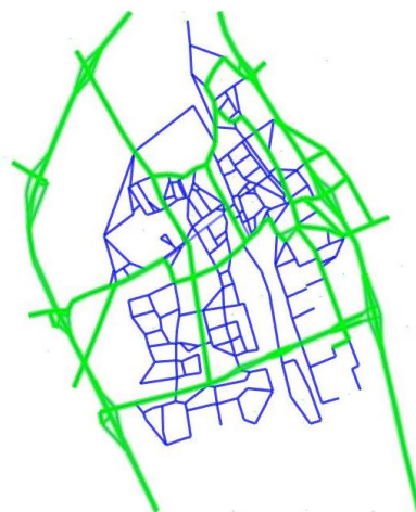
33 FIGURE 1 AD Subnetwork: feasible links for AD subnetwork are shown with (bright) green and the rest with (dark) 34 blue. 35 36

21 Figure 2 demonstrates the convergence of all three algorithms for the chosen scenario. All three heuristics 22 seem to converge by the end of the run, yet each requires a different number of function evaluations. SPSA 23 in this case converges after approximately 500 iterations, each requiring 3 objective function evaluations. 24 The number of iterations for SAA was set to 500, but as evidenced by the figure, it converges in less than 25 300 iterations. The number of fitness function evaluations per iteration for SAA can vary based on 26 acceptance threshold for deterioration in objective function. In this case, the number of fitness function 27 evaluations was 1500. On the other hand, GA converges in about 300 generations each evaluating a 28 population of size 120. Therefore, the general number of function evaluations for GA is much higher than 29 the other two. Regarding the trends, the GA graph has the smoothest curve since it reports averages and 30 best values of a population while SAA has the sharpest decreases due to high temperatures in first iterations 31 and reannealing processes after the initial iterations. SPSA seems to have a reasonable convergence curve. 32