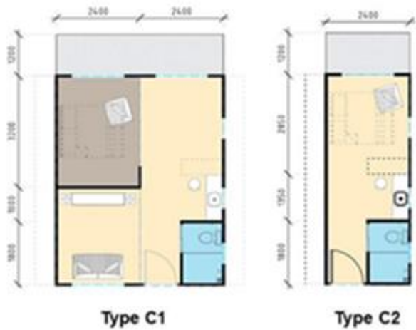
Figure 5. Proposal layout for type C

In contrast, type C offers a different arrangement compared to previous units. The unit will be attached or 'slot-in' from the short part of the unit. The non-load bearing wall can be adjusted according to the spatial requirements and the dimensions are 7.2 m (l) x 2.4 m (w) x 2.5 m (h).