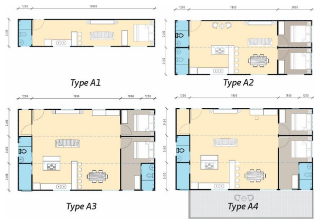
Figure 1. Proposal for type A

The suggested size of type A is 2.4 m x 12 m, which formulated from the typical ISO container permissible on Malaysian highways. The typical height for each unit is 2.5 m (interior) / 2.9 m (exterior). Each unit is equipped with a living area, kitchenette with a wrap-up dining space and a small bathroom. The unit is supposed to be standalone or have an embedded structure. The unit is mobile and can be transported from one location to another. For the type A1, the unit is suitable for a starter due to its condense space. The module can be installed parallel to the building as to maximize the view from the sideways. As usual, the unit can be an add-on for further expansion. In the A2 design, the potential of the extension was demonstrated in the design. Further, in the type A3 and A4, the potential to combine three units together was demonstrated and the additional accessory such as balcony was demonstrated in the type A4. As mentioned earlier, this type allows more sunlight into the building.