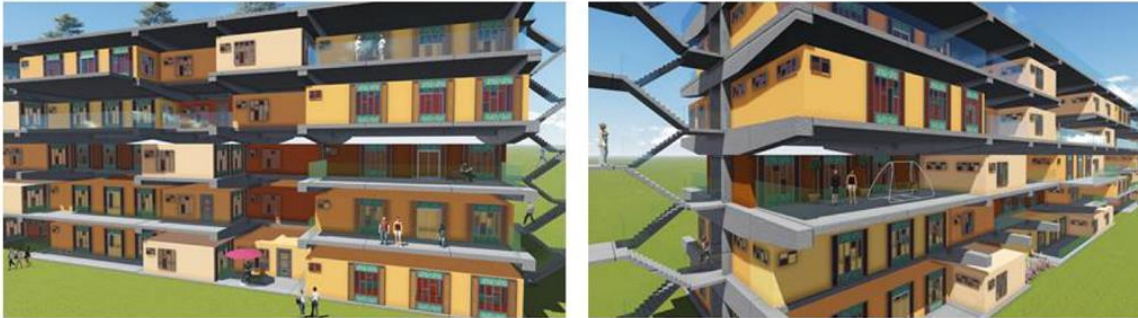
Figure 2: Typical layout for type A