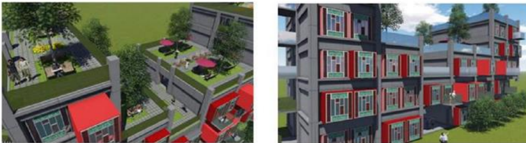
Figure 6. Typical layout for type C