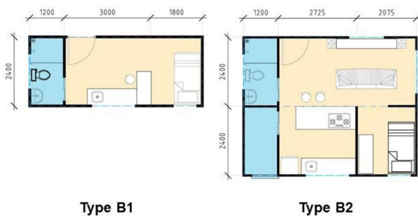
Figure 3. Proposal layout for type B

This type fairly offers something in the middle, it is not that wide and can be easily transported and a right size for the young starters to begin with. (design workshop).