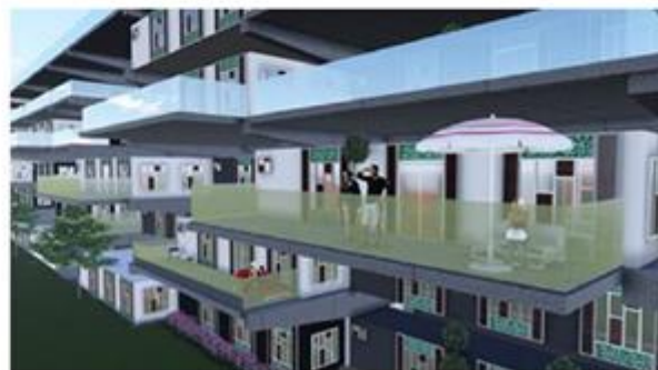
Figure 4. Typical layout for type B