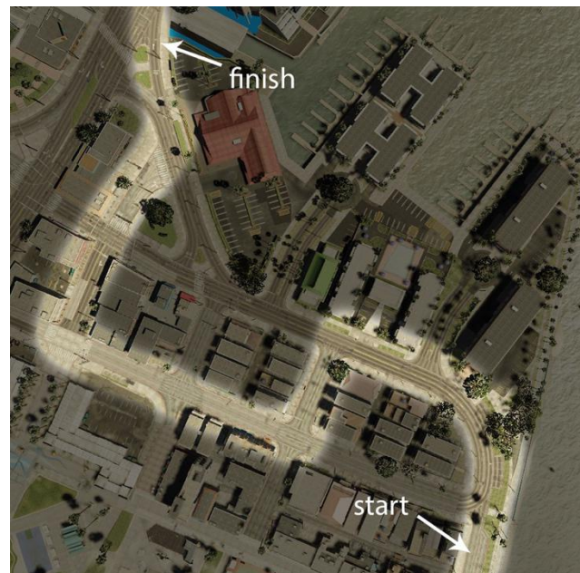
Figure 1 Scenario route in the GTA V world.

S12: Police chase. As the cyclist reaches the traffic light, there is a high-speed police chase on the road the cyclist is about to enter.