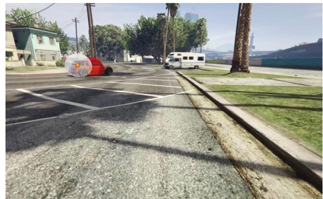
Figure 5 Real-time render of the participant's gaze at a car at an intersection in the GTA V world. These augmented cues were not visible during the actual experiment.

The gaze coordinates from the eye tracker are integrated into the GTA V environment in real time, and thus it is possible to measure which objects a participant is looking at. Figure 5 depicts a real-time rendering of a participant's gaze at a car at an intersection.