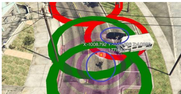
Figure 3 Situation 2 (Car leaves parking space). A car leaves its parking space in front of the cyclist. Circle annotations as in Figure 2.