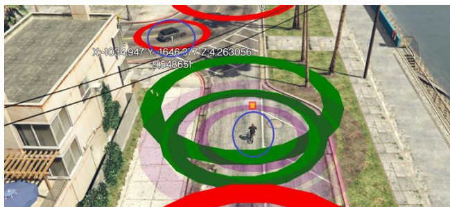
Figure 2 Situation 1 (Car from the left). A car drives past from the left side; the cyclist is going straight ahead. In this visualization, the cyclist is marked with purple circles. The red and green circles are triggers. A trigger is red by default and turns green when the cyclist enters it. The small square marker represents the participant's point of visual attention in the virtual world.

The traffic in the scenarios was triggered by the participant's actions. When the participant entered a trigger (i.e., a circle with a certain radius), a piece of code was executed, instructing an actor (i.e., road user) to perform a specific action. For example, when the participant entered a trigger circle, a car started driving. Traffic lights were also controlled by triggers.