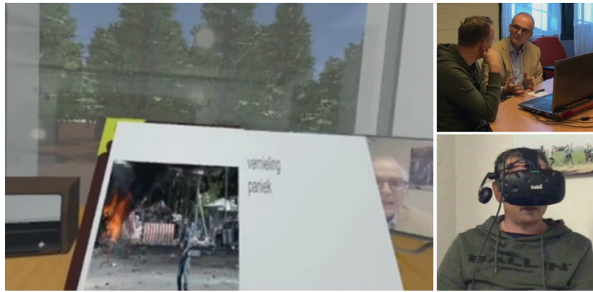
Figure 3. VR view from the HMD of a patient. A book on a table displays self-selected images. The self-selected images are displayed on the left page. Text to describe memories and emotions connected to the images can be added on the right page. A computer screen on the table of the patient (left) allows for virtual contact with the therapist. The window outside displays a virtual world that can be changed according to needs. Behind the book there is a radio where the patient's favorite music can be played, serving as reminders for the images displayed. Between images, there is opportunity to play distractor games, or perform relaxation techniques. This environment is calibrated to increase the overall immersion of the experience to maximize engagement. On the right are pictures of the setting of the intervention.

VR = virtual reality; HMD = head-mounted display