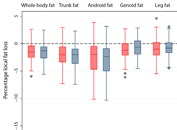
Figure 2. Change in local fat percentage in the whole body, trunk, android, gynoid, and leg area after the intervention, stratified for gender. Red: women; Gray: men. The lower and upper boundary of the boxes indicate the interquartile distance (IQR) (the 25th and 75th percentile). The line within the box is the median. The lower whisker indicates the lower adjacent value; the upper whisker indicates the higher adjacent value. Gray dots are individual outliers indicating values that are more than 1.5 times the IQR.

circulating metabolic biomarkers. Since the lower body fat measures themselves do not show any association with metabolic biomarkers, the latter association seems to be driven by the whole body fat measure. Hence, after adjustment for BMI, we observed that a higher percentage of fat in the trunk or android body regions (abdominal fat) associated with a lower concentration of lipids in (extra) large HDL particles and smaller HDL diameter, a higher concentration of lipids in (extra) large VLDL particles, and higher circulating levels of leucine, isoleucine, serum triglycerides, glycoprotein acetyls, 3-hydroxybutyrate, and glycerol.