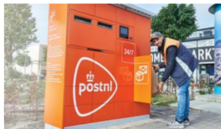
Fig. 2. Example of a Parcel locker

As can be seen in Table 2 the only thing that differs is the height of the lockers; the width and length are exactly the same. The current overall dimensions of the complete parcel locker are, 1610mm x 525mm x 1758mm. The parcel machine has a touchscreen and can be used to draw signatures. A camera is mounted in the locker as well for safety reasons and the machine is reasonably vandal proof. Consumers will receive an email/text when the parcel has arrived in the locker. The machine has a scanner as well, to be able to scan ID's when needed. The maximum storage in this machine is 3 days, where after the parcel will be transported to a nearby retail location.