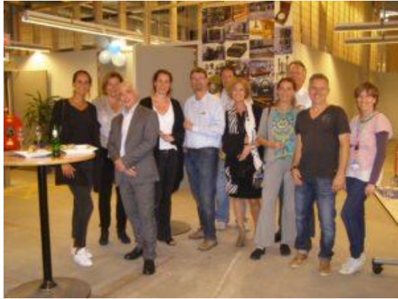
Opening of our new depot for academic heritage.

https://librarian.tudl.tudelft.nl/2016/10/01/the-future-of-libraries-just-move-forward/