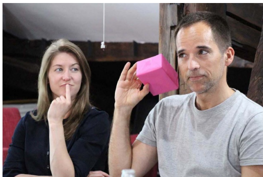
Figure 3. A teacher carries out an experiment to obtain information of what is inside the box.

In the last part of the activity I ask whether you were engaged in doing science [13]. Not all teachers agree with you that you were engaged in doing science as you applied formulated hypotheses, did experiments, observed and so on. Some colleagues do not agree that this pink box is related to doing science. To make the link with ‘real’ science more explicit, I ask whether you could think of a real physics experiment that resembles this experiment. We consider the research question ‘what constitutes matter?’ and the related experiments carried out in the last century. There are similarities between wanting to know what is inside the box and what is inside an atom. The eagerness to know has made us build the biggest and most expensive physics experiment in the world.