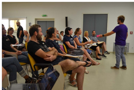
Figure 2. Teachers take turns in carrying out their proposed experiment.

never encountered a box of Lego would doubt that there is Lego inside.