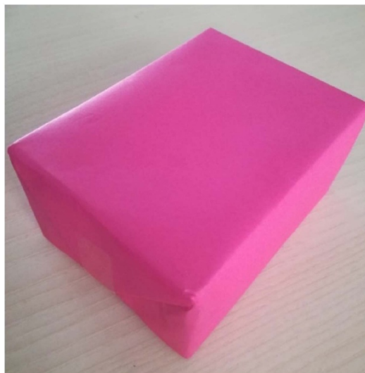
Figure 1. The NOS activity only requires a small box wrapped up in pink paper with something inside.

Especially after shaking the box, figure 3, some teachers have a clear idea of what is inside: 'LEGO!'. As one colleague claims: 'I surely know how Lego sounds!'. My response is that this could indeed be true, Lego could be inside but I am not sure myself since I did not make the box. There can still be reasonable doubt about the correctness of the claim: 'Does everyone agree the box contains Lego? What if you are not familiar with Lego? If you have never seen it, have no idea how it looks like or how it sounds?' In the ensuing discussion it is recognized that a person who has