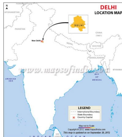
Figure 2 : Location of Delhi

Among all the state and Union Territories, the city of Delhi is overwhelmingly urban; with 75 % of its total area (1483 sq. km) falling in urban jurisdiction and the population density in urban area is as high as 14, 698 persons per sq. km as per 2011 Census. 16.37 million Population i.e. 98 % of the total population (16.79 million) of Delhi is residing in urban areas. The highly urban character of Delhi exerts a tremendous pressure on public delivery of services including housing, construction of new buildings, energy demand, and poses a great challenge for the city administration.