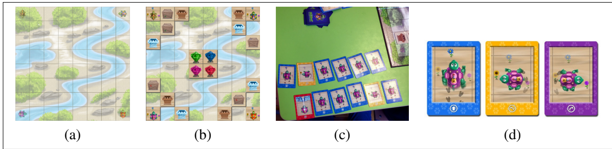
Figure 1 – The Robot Turtle game: (a) an empty board (b) a board with a maze (c) one solution to a Robot Turtle exercise in the classroom (d) the basic movement cards