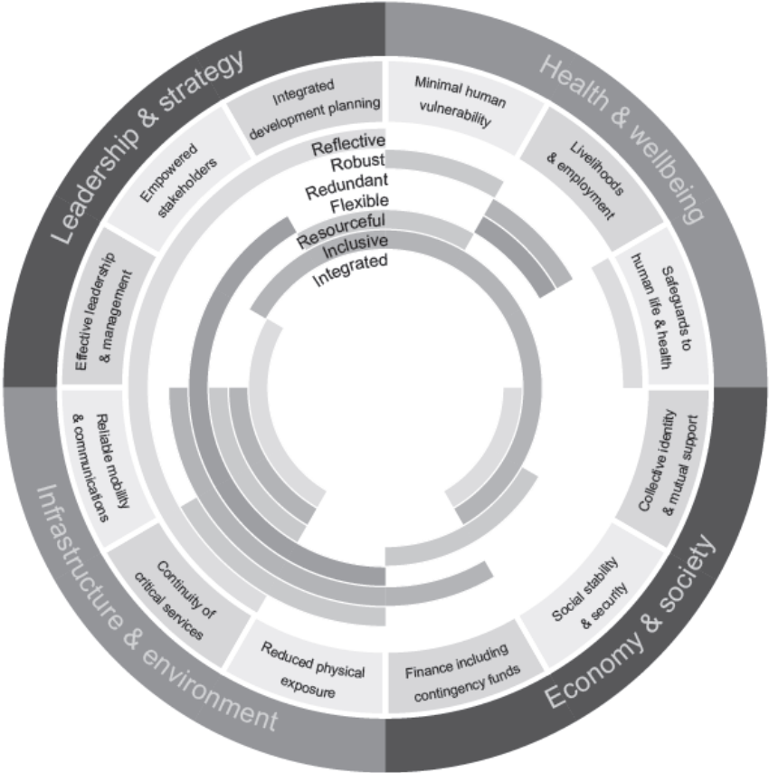
Figure 2: The City Resilience Framework as developed by ARUP