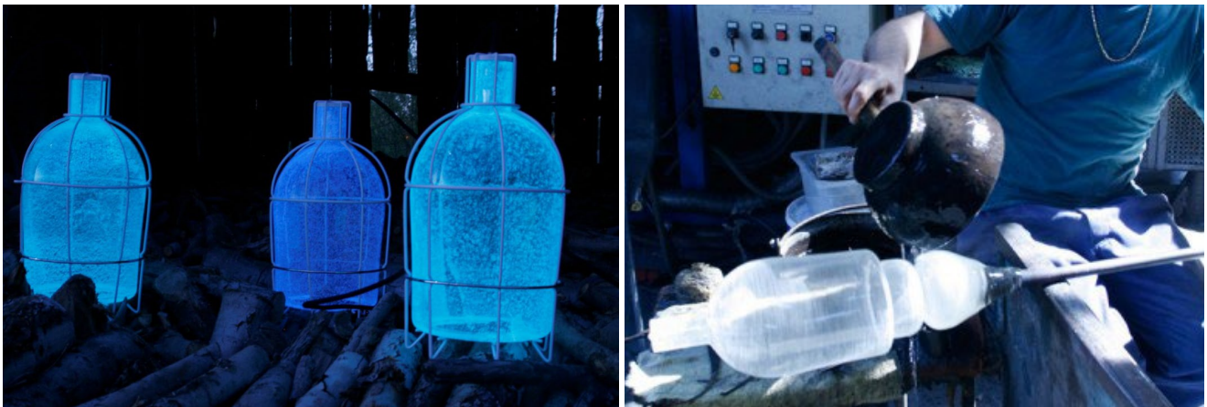
Figure 11. Designers exploit the potential for embedding photoluminescent pigments into the transparent body of glass, using a traditional technique: left, Trap Light by Gionata Gatto and Mike Thompson; right, Murano glass blowing process.