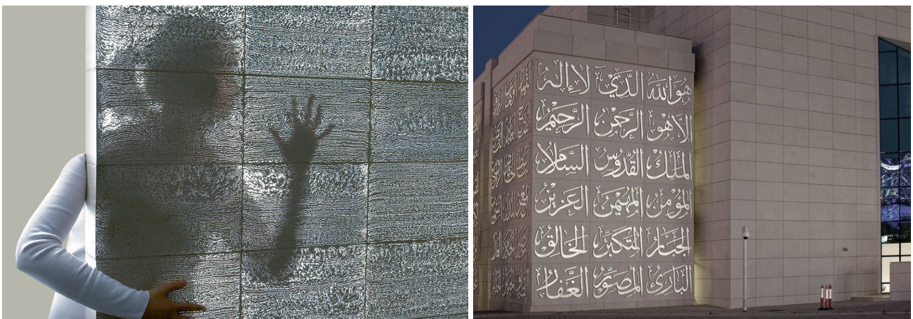
Figure 12. The previous practice of collaging glass and concrete materials next to each other is transgressed in the creation of light-transmitting concrete: left, precast building blocks by Litracon® (image source: Litracon®; reprinted with permission); right, Al-Aziz Mosque's light-transmitting façade (design, production, and photo by LUCEM Lichtbeton®; reprinted with permission).

and serVies by Annemarie Piscaer & Iris de Kievith). These creative practices with and through materials challenge the norms and conventions ascribed to materials, including their sociocultural meaning and their use. For instance, a realization of the potential of animal blood, discarded in large quantities by slaughterhouses, as a material source triggers Stittgen to further explore its “material-ability.” The designer exploits the known affordances of blood (e.g., to dry) to process it into a powder that can then be heated and pressed into a black, solid material. The process uncovers and exploits novel affordances of blood, or more specifically albumin protein, to act as a binding agent, in creating a protein-based biopolymer that is 100% processed blood.