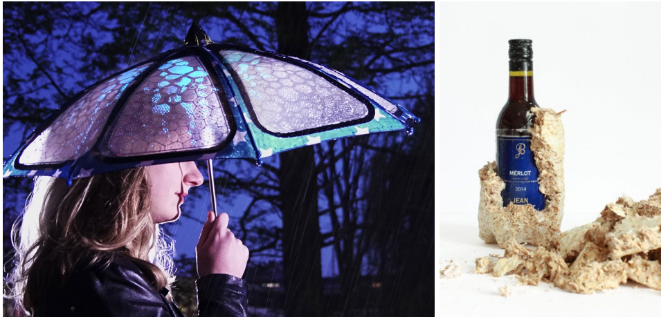
Figure 6. The experiential potential of materials: left, the umbrella pushes for a novel experience of rain, through the custom-made water-activated EL print (designed by Stan Claus; image source: Weirisma Brothers; reprinted with permission); right, mycelium-based packaging design, by Davine Blauwhoff, offers a distinct unboxing experience (reprinted with permission from Davine Blauwhoff).

view that material potentials are materials' ever-existing effects awaiting the creative mind to recognize them, independent of the fluxes of the creation process, the designer's skills, the properties of the medium used to communicate the material (e.g., technical information, video of the making process, the processed material, or the ingredients), the social context (who the designer interacts with), time, and place (what equipment the designer has access to).