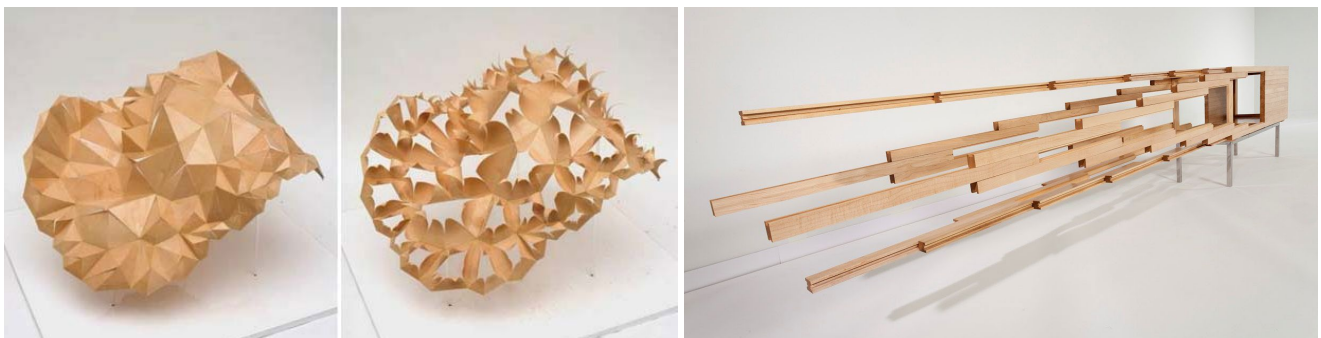
Figure 3. The passive (left) and active (right) role of wood in conceptualizing kinetic forms: left, shape-changing wooden veneer; right, Explosion Cabinet by Sebastian Errazuriz (image source: left, Steffen Reichert, 2008; right, Carnegie Museum of Art, Pittsburgh, Women’s Committee Acquisition Fund; reprinted with permission).