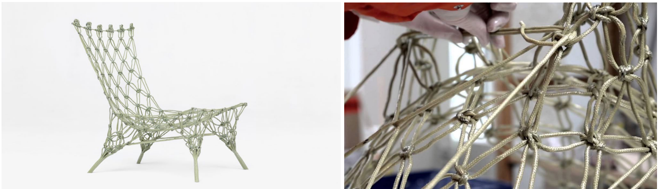
Figure 8. Designer’s intervention in the process of making brings out the “textile-ness” of carbon fiber: left, Knotted Chair by Marcel Wander; right, shaping the hand-braided cord impregnated with epoxy resin.

creating volumes with carbon fiber composite, instead of making sheets, to bring forth the textile quality of carbon fiber. Here, the novelty is not in separately perceiving the braidability of the carbon fiber cord or the ability of the cord to harden when impregnated with resin, but in combining and sequencing the two in such a way that the 3D volume could be fabricated. Knotted Chair is a good example in which the other categories of materials potential are to a great extent interlocked in describing the designer’s creative contribution to materials development and product design. The hand-braided chair elicits an emotional response (i.e., experience) in connection to its strong and rigid body that can withstand the weight of an average adult person, despite its delicate textile look.