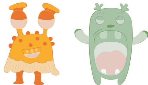
Figure 6. Graphic designs for two monster plates by Hannah Goss.