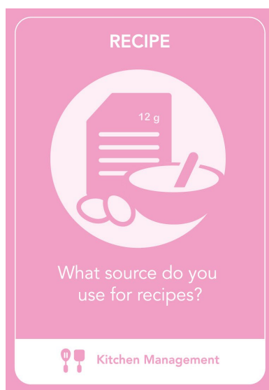
Figure 4. Revised design of a topic card, with the category name in contrast.