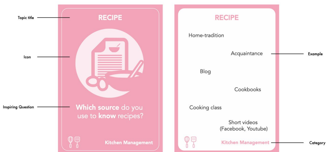
Figure 2. The front (category, topic title, icon & question) and the back (category, topic title, example keywords) of an individual card in the original design.

Based on these insights, we decided to develop a set of general instructions containing basic information about the background, aim and structure of the card set. In addition, we created instructions for six games that would facilitate using the