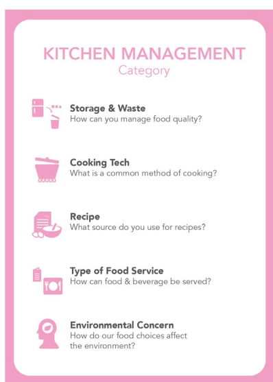
Figure 3. Example of a category overview card, showing the five topics in the category kitchen management.

The assignment was performed by 11 groups of 3-5 students, each composed of 1-3 design students and 1-2 non-designer friends. They started the session by choosing two games they wanted to play. They could also invent an additional game themselves.