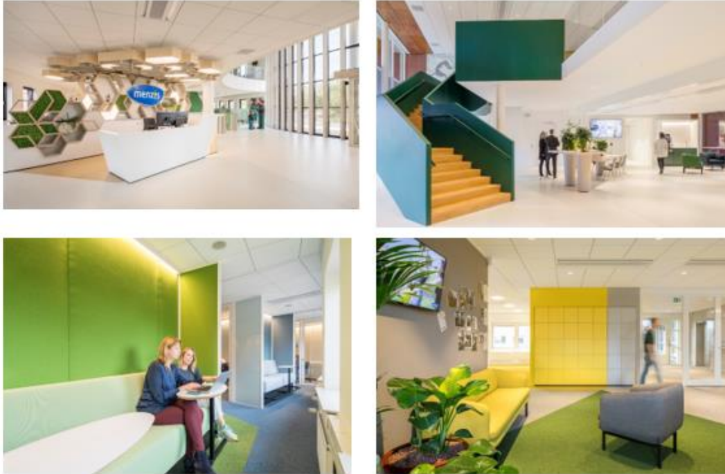
Figure 2. Menzis Building in Enschede, the Netherlands