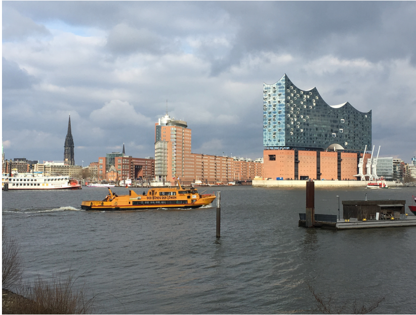
FIG. 1 The Elbphilharmonie

architectural mundanity of MediaCityPort. From 2002 to 2003, they lobbied for the idea of an iconic concert hall placed on top of the Kaispeicher and designed by the two newly crowned star architects. In 2003, they introduced Herzog & de Meuron's visualization to the media, launching what later would be called the Elbphilharmonie to the public. This proposal, henceforth, garnered media and civic support. The German weekly news magazine Stern 17 reported favorably on the proposal in June 2003. The first big article appeared locally in the Hamburger Morgenpost in August 2003. A few months later, the Hamburg Senate abandoned the MediaCityPort project and eventually in October 2005, the Hamburg State Parliament consensually approved building the Elbphilharmonie on the basis of a feasibility study and authorized the Hamburg Senate to award the project.