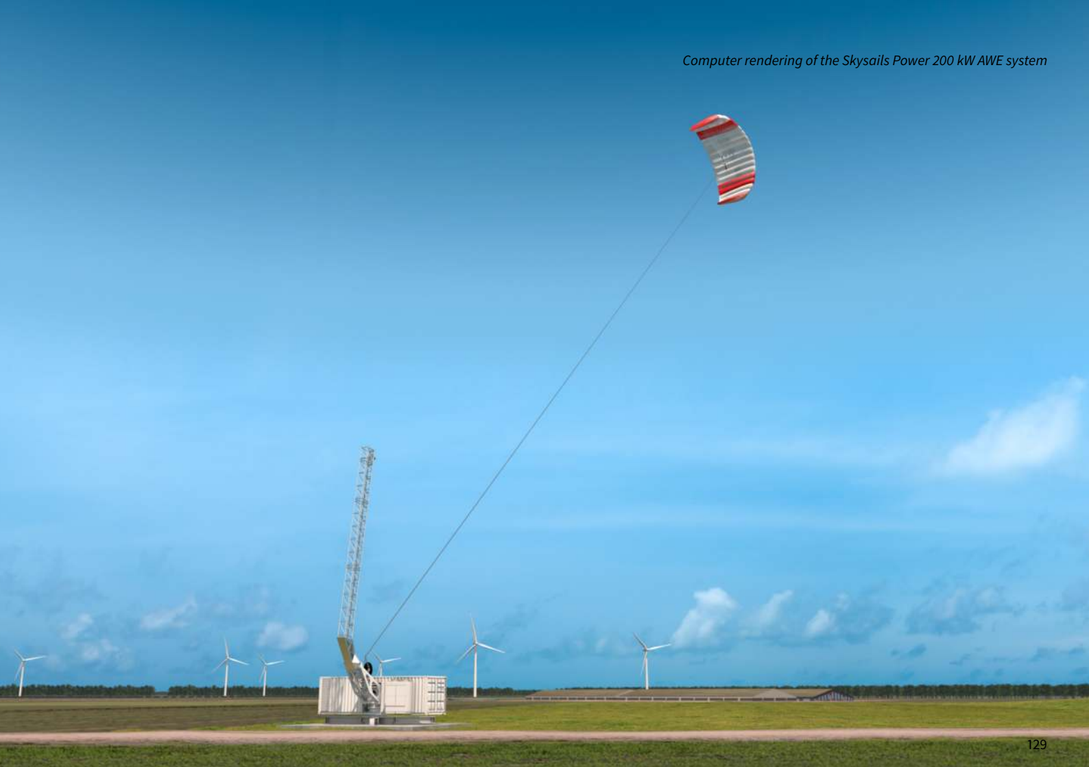
Computer rendering of the Skysails Power 200 kW AWE system