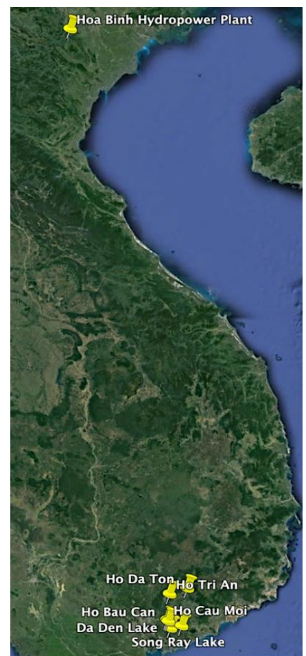
Figure 3. Selected reservoirs in this study. A hydropower reservoir in the north and six irrigation reservoirs in the south.

farmlands and shift reliance on rain-fed agriculture to managed and efficient agricultural practices. Deploying FPVs decentralizes the energy system and makes it more resilient; moreover, it helps sustainable management of Vietnam's vast water resources, particularly through diversifying investments in infrastructure for the water sector and deepening public participation.