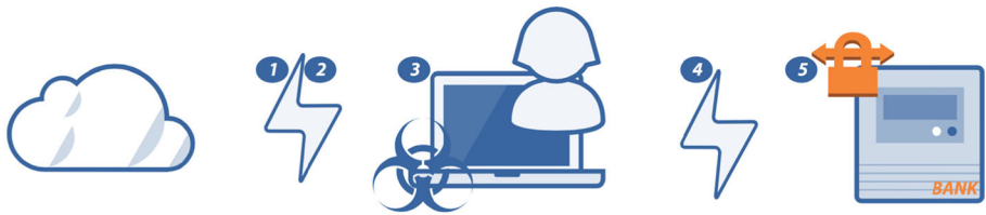
Archetypical Man-in-the-Browser attack