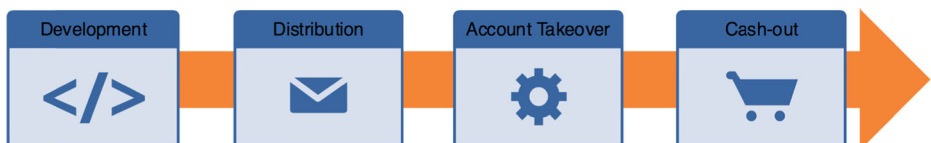
Fig. 7 Value chain of resources of a (financial) business-oriented RAT attack

Looking at the first novel value chain, the first three elements (source code/crimeware kit, infrastructure and infections) score some positive points on the different components of the framework. Starting with the scale, we have shown that man-in-the-browser attacks rely primarily on infections in bulk, accompanied by, thus, a large infrastructure of infected clients. Next, the activities in the first elements can be described very specifically due to the standardised way of operation and the high availability of the most popular banking malware