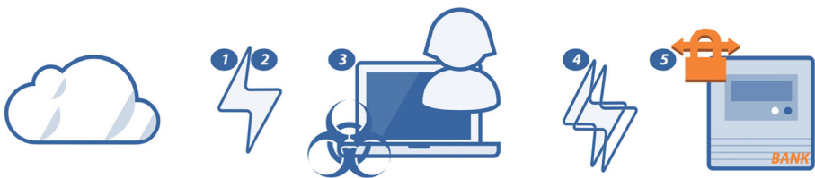
Novel Man-in-the-Browser attack

However, the operated crimeware kit (1) in this case allows the attacker to use dynamic web injects instead of fully automated versions. The infections (2) are identical