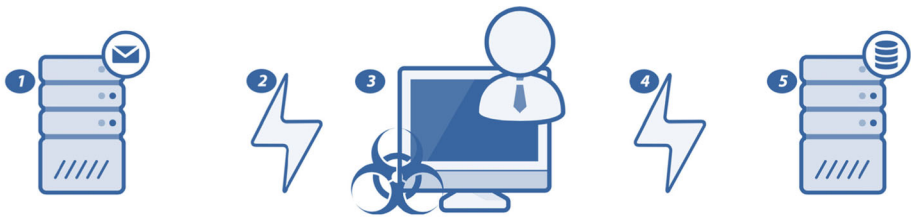
Remote Access Tooling targeting Banks