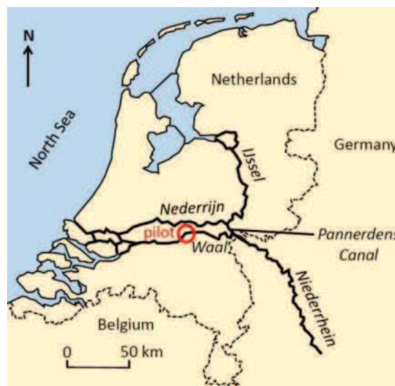
Figure 1. Location of pilot of longitudinal training walls in the river Waal.

The effects on hydraulics and morphology were assessed by analysing field data (De Jong et al., 2021) and carrying out numerical simulations (Paarlberg et al., 2021). The field data comprised water level registrations, flow velocity measurements and bed topographies derived from bathymetric surveys. The effects on how vessels used the waterway were assessed by analysing AIS data (Indah-Everts and Hermans, 2021). The effects on ecological conditions were studied by a broad array of biotic and abiotic field surveys (Collas et al., 2020). Surveys and interviews were used to assess how stakeholders and the local population experienced the pilot with the training walls (Verbrugge and Van den Born, 2021).