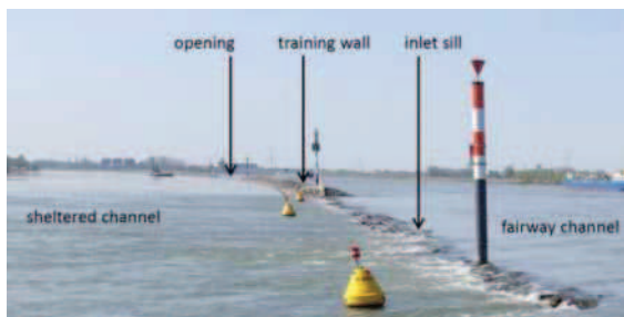
Figure 3. Inlet sill at upstream end of the longitudinal training wall at Wamel.

The system tested in the pilot opens perspectives for integral solution of several river problems. It performs better than the old system with groynes thanks to spatial diversification through separation of functions. The pilot generally confirmed the expectations about the potential of the new system. No unforeseen negative impacts have surfaced. The new system does not solve all river problems completely, but it offers more space for further improvements in the future than the old system (Mosselman et al., 2021).