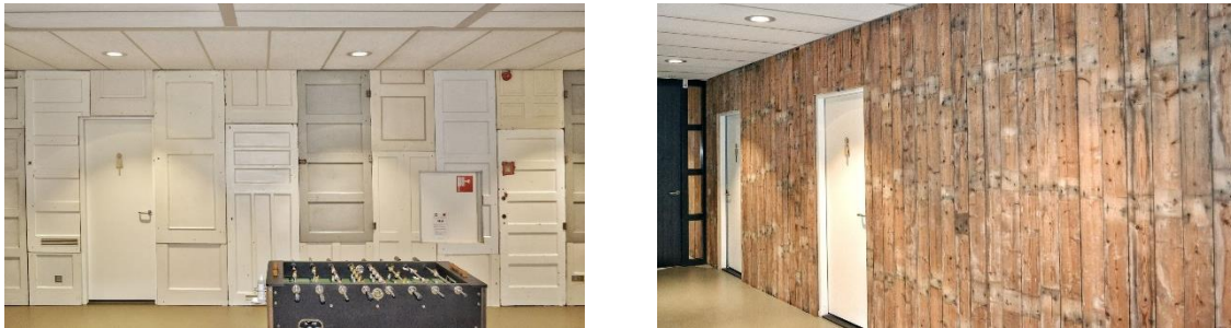
Fig. 2. Reuse of recovered doors (left) and floors (right) to decorate walls in a circular interior design project (Media Park)

The reuse supplier received an assignment in 2020 via the interior designer to source reclaimed inner doors and wooden floor coverings (Figure 2). Specifically, this consisted of 72 door parts and 100 m 2 of recovered wood for wall decoration. The demolition contractor had disassembled the floor elements from the deconstruction of a museum depot and put these element in storage; the doors had various origins. The contractor had invited the interior designer to observe and select the stored materials. In addition, it was agreed with the designer that the wooden floor elements had to be refurbished on the visible side through a machine-based brush treatment. The materials were brought to the Media Park by the transportation firm and placed on location with the help of a truck-mounted crane. In the end, 26 doors appeared redundant, and these were brought back to the reuse supplier. The project lasted from March 2020 to June 2020. This case provides the backdrop for the (retrospective) application of the four tools.