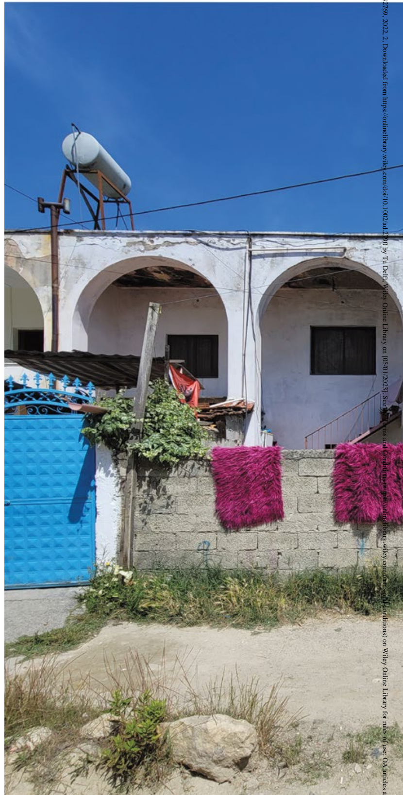
Kombinat, Tirana, photographed in November 2019 and June 2021

The statue of Stalin stood in the main square of Kombinat, which was considered a model working-class neighbourhood by the Communist state, embodying the transition from an agrarian to an industrial Albania. 2