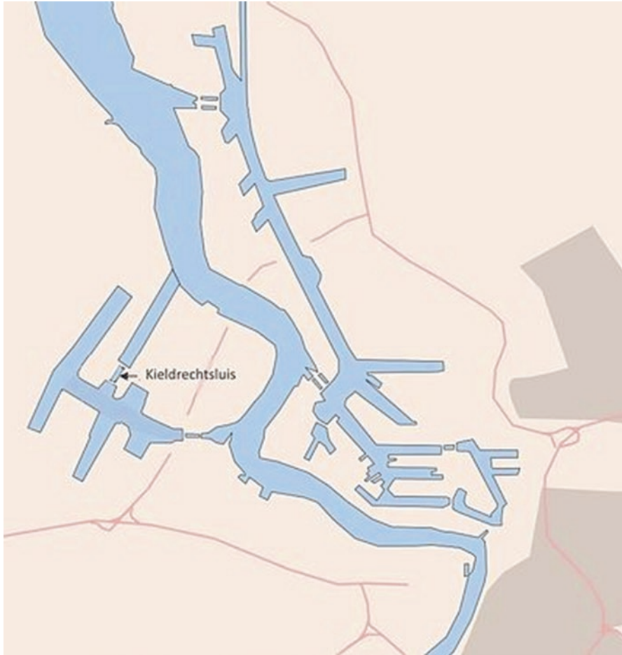
Fig. 3 Overview of the location of the Kieldrechtsluis.