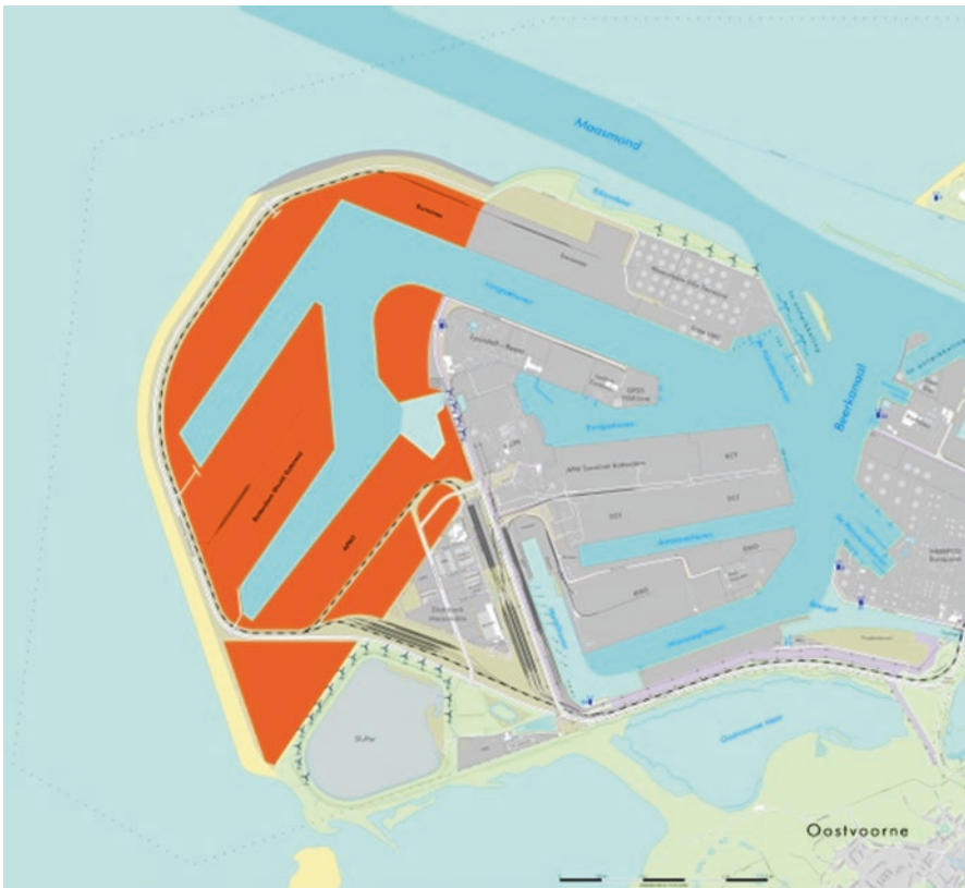
Fig. 2 Overview of the Maasvlakte 2 project in the port of Rotterdam.

The Second Maasvlakte (MV2) has been financed primarily by the Port of Rotterdam Authority. The port authority borrowed money from the European Investment Bank (€900 million), the Bank Nederlandse Gemeenten (€450 million), and a bank consortium consisting of ING, Fortis, and Rabobank for a loan of €450 million. The total loan is meant to finance the MV2 and the infrastructure in the Port of Rotterdam. The consortium PUMA, composed of the companies Boskalis and Van Oord, has built the first phase of MV2. The companies VolkerWessels and BAM have been responsible for building the quays, railways, and roads. The project’s main aim was to reclaim land from the sea and to build an additional port area that will be primarily used to accommodate new container terminals. In September 2008, after years of discussions, planning, and protests, the building of the MV2 started (the orange part in Fig. 2) and was finished after approximately 5 years, in May 2013, for a