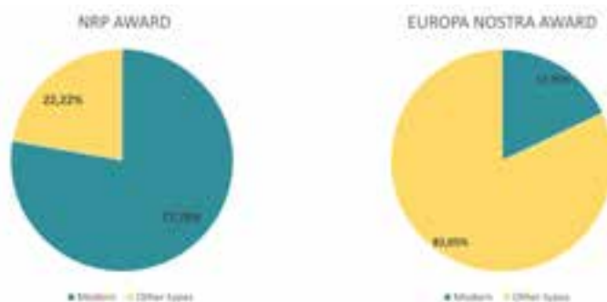
Figure 1. The proportion between modern and non-modern heritage buildings among the winners of the NRP and Europa Nostra awards. Own illustration.

Figure 1 shows the proportion of AR projects of modern and non-modern heritage buildings among the NRP and Europa-Nostra winners. This suggests that there might be a lack of attention to modern buildings at the European level; the DOCOMOMO rehabilitation awards might fill this gap.