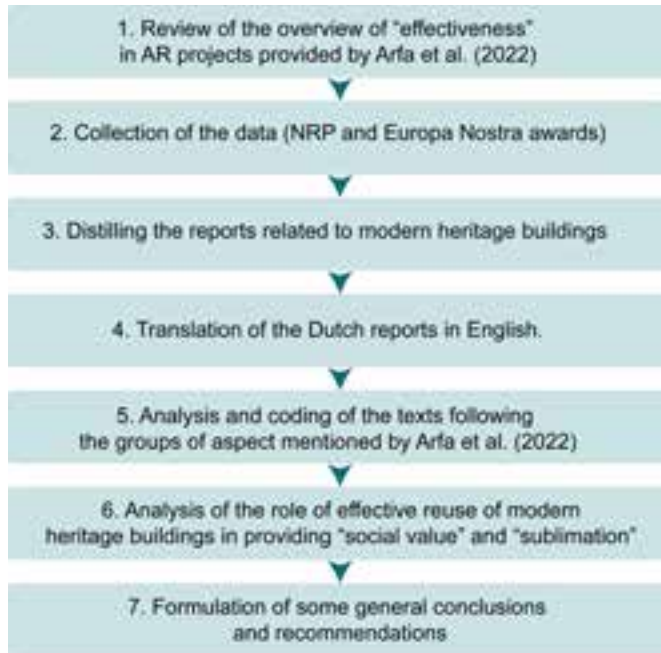
Figure 2. The procedure of conducting the research. Own illustration.

The methodology used in this research has been adapted from the research conducted by Arfa et al. 9 with some amendments and it is outlined in Figure 2 . The NRP and Europa- Nostra awards have been selected due to being among the most well-known awards for AR at the European and Dutch levels and having access to their jury reports.