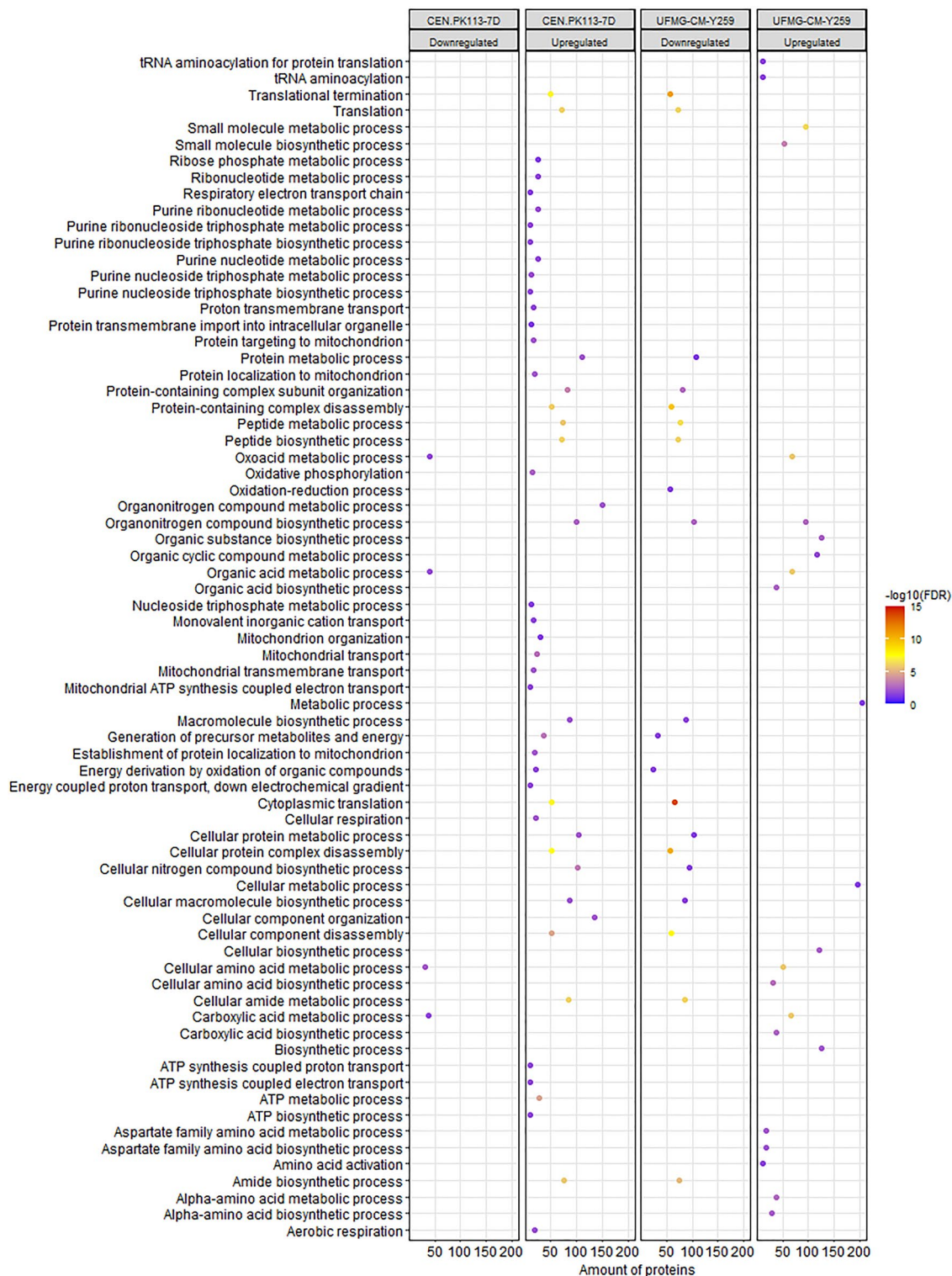
Figure 2. GO biological process overrepresentation analysis for differentially expressed proteins for Saccharomyces cerevisiae strains CEN.PK113-7D and UFMG-CM-Y259 cultivated on sucrose compared to glucose grown cells. For JP1 no significant enrichments were detected. The number of proteins in the dataset that falls in each overrepresented biological process is shown on the x-axis (amount of proteins).

which correlates with a 1.21 fold increase in the respiration rate (Sucrose: q_{O_2} = 2.96 \text{ mmol/g}_{DM}/\text{h} , on glucose q_{O_2} = 2.45 \text{ mmol/g}_{DM}/\text{h} ) 3 . For the UFMG-CM-Y259 strain a 1.27 fold increase in the specific oxygen uptake rate was observed for sucrose 3 ( q_{O_2} = 3.34 \text{ mmol/g}_{DM}/\text{h} , on glucose q_{O_2} = 2.63 \text{ mmol/g}_{DM}/\text{h} , Table 1). Nevertheless,