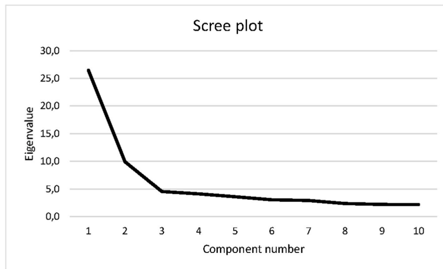
Fig. 1. Scree plot.

term implications has been gradually raised after 2015 (Gandia et al., 2019), but remain still relatively scarce and certainly inconclusive (Milakis et al., 2017a; Milakis and Müller, 2021). Thus, experts might feel less confident to express estimations for implications with limited background knowledge. Another explanation could be that indirect effects at least partly depend on direct effects, implying that uncertainties about indirect effects must be at least equal to, but likely larger than those about direct effects.