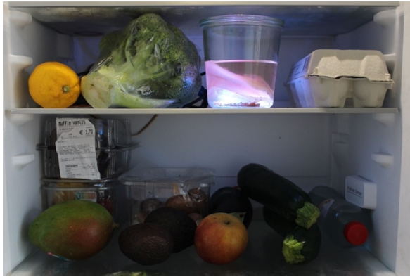
Figure 2: The first iteration of the prototypes was designed for short movies to depict and explore the fictional scenarios. In that first iteration, we controlled the light manually to simulate the interaction with a conversational agent.

The electronics were designed to simulate the interaction with a conversational agent with sound and light (Figure 3). When people open the lid, the light and sound play. That encourages people to get closer to the jars to listen to the conversation, which in turn invites them to have a closer look at the living-like creature and sense the smell, which makes the experience stronger. People are encouraged to open the lids by mimicking other visitors and by simple messages written on the table/tiles that state "Open the lid." At the same time,