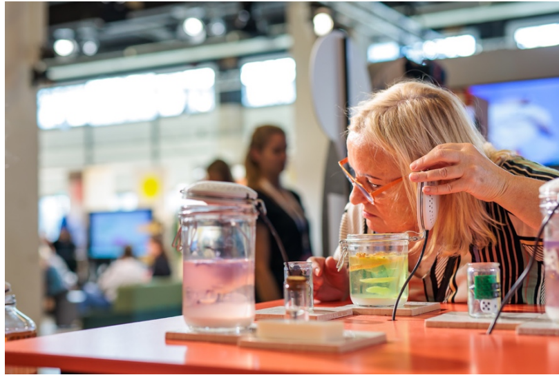
Figure 1: Conversation Starters is a series of prototypes that explore how to design explainable interactions with AI. By opening the lids, visitors can listen to the fictional agent and smell the organisms growing in the jars.

need to be better situated [4, 12, 14]. While interactive approaches have emerged in Explainable AI [20] not much attention has been paid to conversational approaches for explanations [10] nor to the active role that users and agents have in those processes [14].