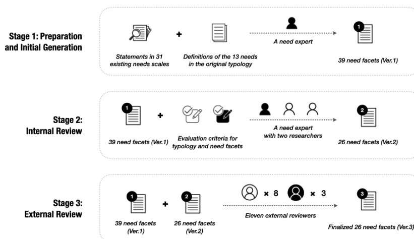
Figure 1: The development of the detailed typology of basic needs involves three stages.

Next, we categorized all 665 need statements collected from existing scales according to the definitions of the thirteen fundamental needs. For most statements, this was straightforward since the source paper used the same terminology. We, however, reallocated some due to further review of the statements. For some, it was less straightforward because the source paper