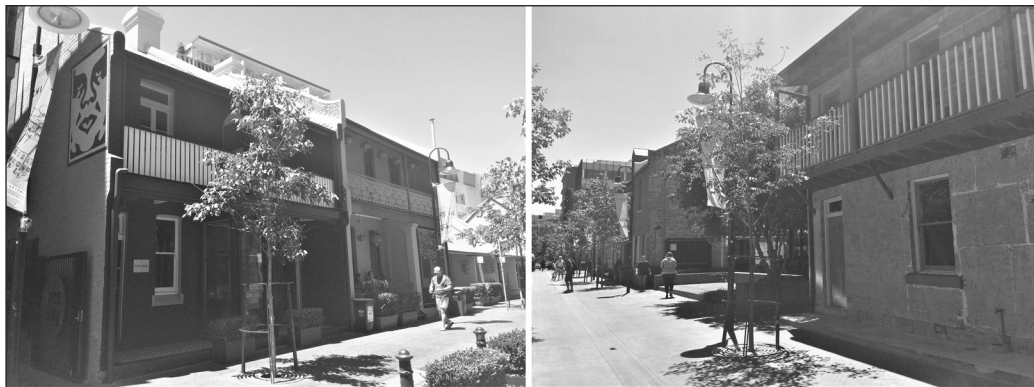
Figure 2: Kensington Street Cottages in Central Park, Sydney, AU, March 2018.

if you take the blunt view on the return per square metre, it probably doesn't stack up [...] but] it was a huge selling tool for the apartments.