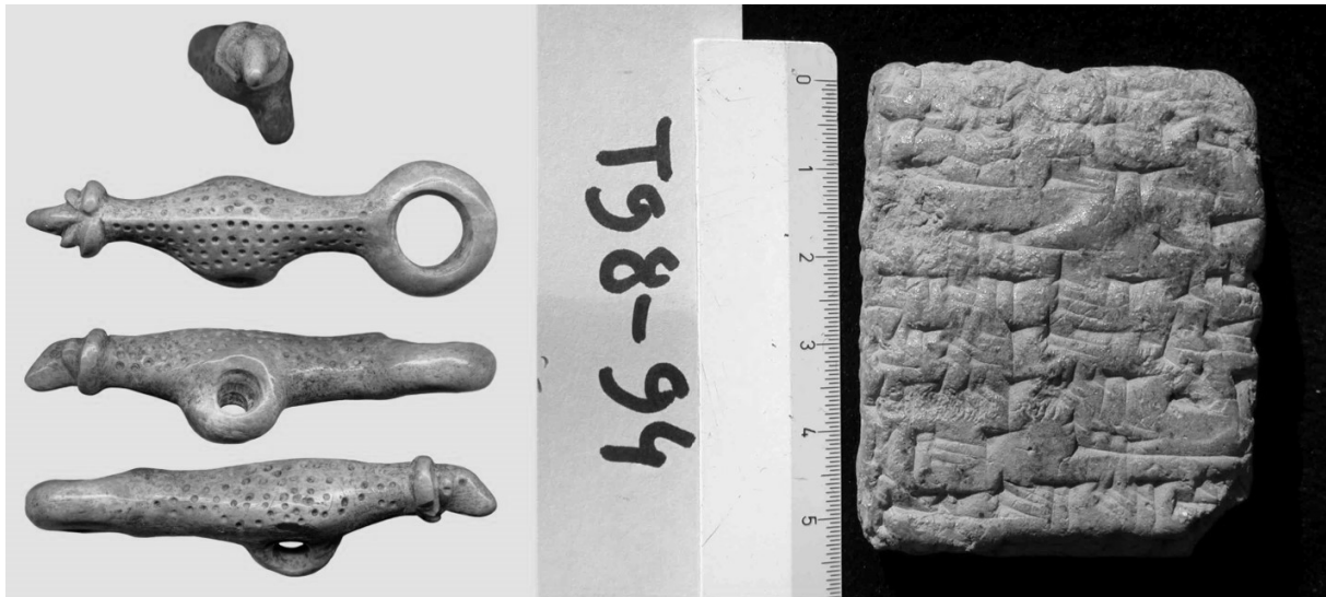
Figure 2. Objects stolen from the Raqqa Central Bank collection. Left, bone buckle (Tell Sabi Abyad, ca. 6500 BC). Right, clay tablet carrying cuneiform text (Tell Sabi Abyad, 1200 BC).