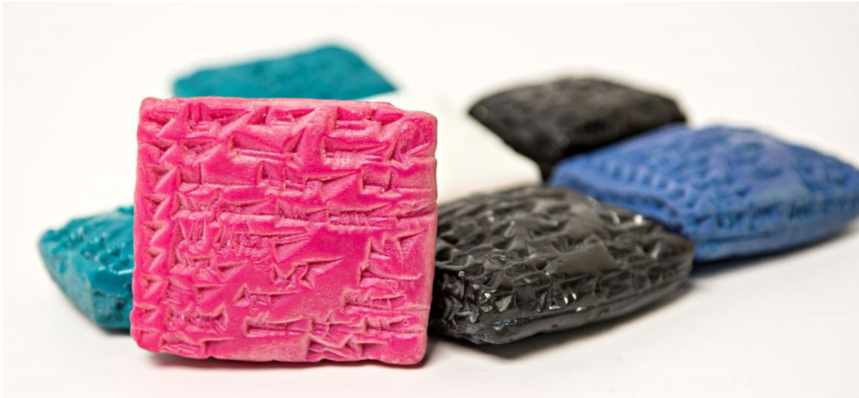
Figure 3. Colored high-resolution prints of Assyrian cuneiform texts from the site of Tell Sabi Abyad, northern Syria.