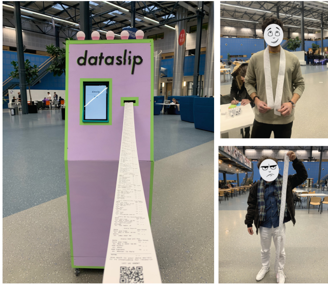
Fig. 1. Dataslip installation and reactions to the receipt.

limited it to five questions encompassing a broad range of products and services that most people encounter on a daily basis: (1) personalized public transport cards, (2) supermarket loyalty cards, (3) credit and debit cards, (4) wearables, including smartwatches and smart rings, and (5) mobile apps, including weather, navigation, web browser, email, instant messaging, music, social media, dating, and period tracking apps. The receipt contains a comprehensive list of the data generated as users engage with these different products and services. It includes short but detailed examples to help users interpret their data.