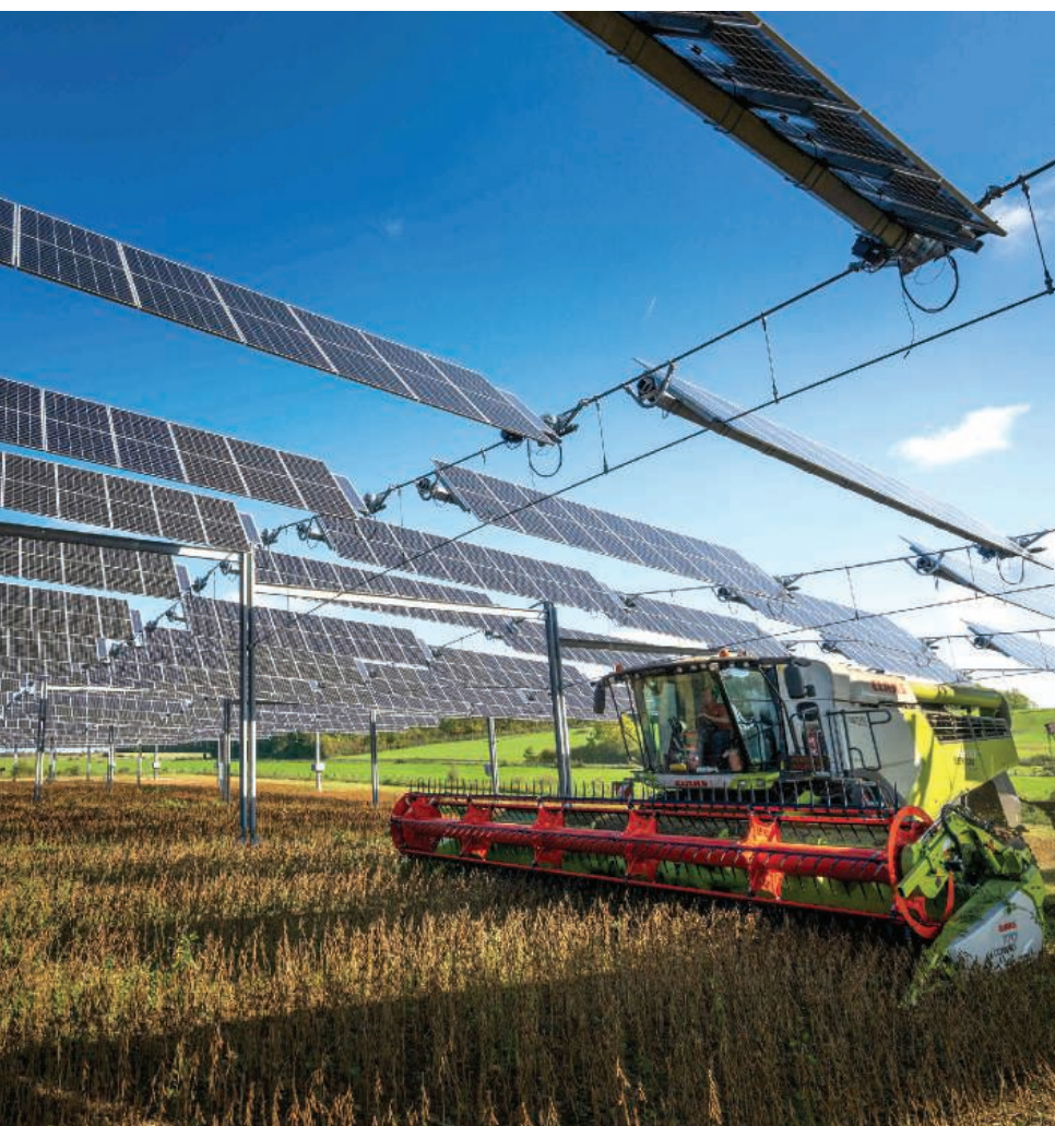
Double-usage of land is demonstrated at this Agrivoltaic site in Amance, France, where the simultaneous use of land for power production and agriculture can also reduce irrigation needs in arid lands.

revenue needed to build and operate a generator over a certain period), where innovations are quickly introduced to the market and where technology transitions happen in months to a few years. Examples of these include hydrogenation for defect control, diamond wire sawing, multibusbars, half-cut cells, and increases in wafer size. The latest tunnel oxide passivated contact silicon (Si) PV technology (commonly known as TOPCON) advanced in 5 years from an industrially relevant laboratory design to commercialization and mass production. Fundamental advances in materials chemistry for cadmium telluride (CdTe) PV have recently also made their way into production in record time. Recent analysis shows that it now takes about 3 years for the average cell efficiency in mass production to reach the efficiency of the champion cell fabricated in the industrial laboratory (6).