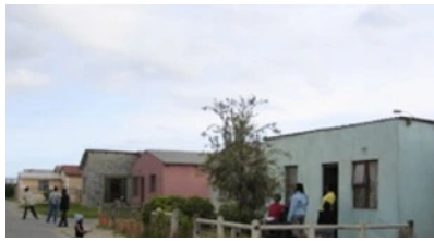
Victoria Mxenge neighborhood