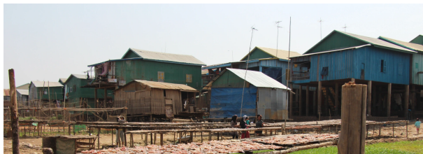
Women play a crucial role in this small riverside community in Phnom Penh, where fish loans provide a sustainable source of income and promote economic empowerment.

At the dawn of International Women's Day , I want to highlight the importance of feminist solidarity and the need to amplify the voices of these women who have been at the forefront of local organisations and planning in their communities. Too often, these women have been overlooked in the writing of (planning and design) history. By celebrating their contributions, we honour their work and challenge dominant narratives that perpetuate the erasure of women's experiences and perspectives.