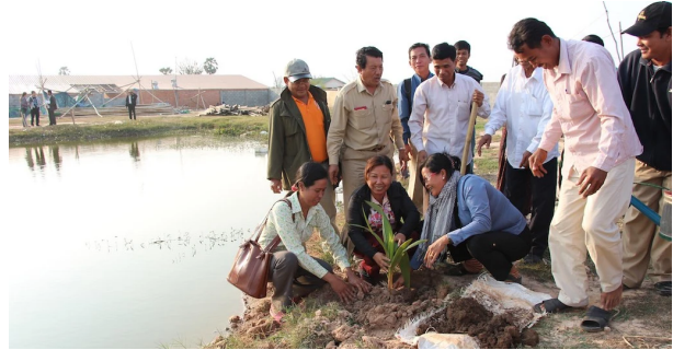
Meeting of Community Leaders Phnom Penh