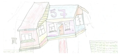
Drawing of a house in Victoria Mxenge by an 11 year old girl