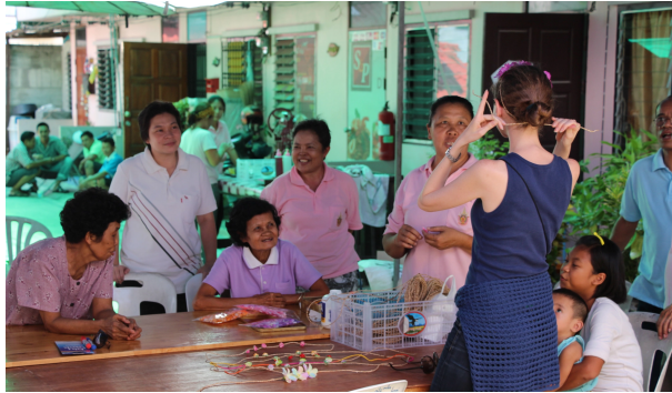
Community leaders Bangkok

finding solutions and creating opportunities for themselves and others. They are agents of change who contribute to social development and gender equality. As an example in South Africa 53% of the 98,920 non-profit organisations (NPOs) are community-based organisations (CBOs), 60% of NPO employees are women, and 49% are volunteers (Swilling & Russell, 2002).