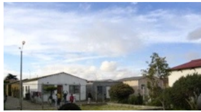
Victoria Mxenge community centre