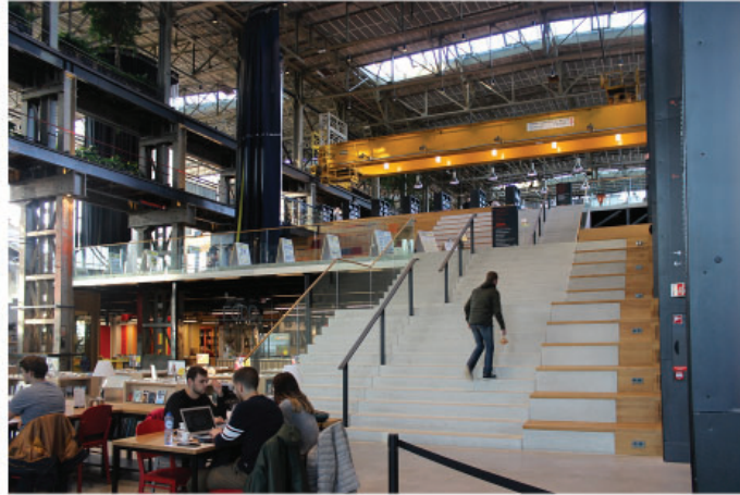
Fig.2 LocHal in Tilburg; the photo shows the interior space of the building as well as end-users within it (Arfa, 2020).