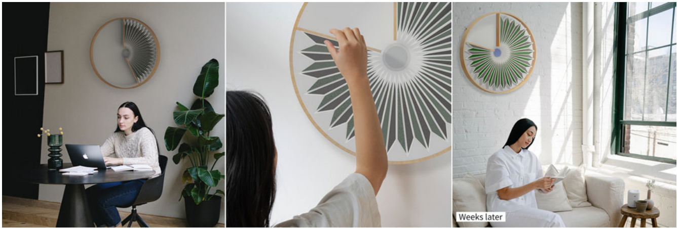
Figure 1. The Daylight Log is a living artefact that unveils the subtle shifts in light conditions within a matter of minutes, providing a suitable timeframe for prompt care of cyanobacteria, while also allowing individuals to be mindful of daylight variations and their range.

of sustainable design. Rooted in a living system approach, regenerative thinking in design suggests a profound understanding of living organisms, encompassing both human and non-human entities, and the ecologies they inhabit, to create human systems that can coevolve with natural systems, replenishing their inherent capacity to endure, flourish, and regenerate without depleting the essential life support systems and resources they rely on (Lyle, 1994). By positioning living artefacts at the intersection of the sustainability discourse and the ontologies that go beyond human entities, this article delves deeper into their potential and explores the unprecedented opportunities that living artefacts present for designers to contribute to regenerative ecologies. Importantly, the article illustrates how regenerative thinking can be manifested at the scale of the artefact, facilitating an amplified capacity for emergence, creativity, and coevolution.