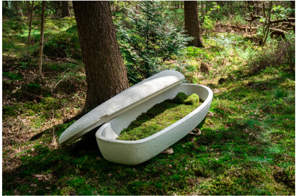
Figure 2. Loop (2019), a living coffin designed by Bob Hendrikk, is cultivated using fungi. (Image Credits: Bob Hendrikk & Loop Biotech).

alignment between human needs and the temporal qualities of organisms and material decomposition in this example, dissolves the boundaries between production and use, and between life and regeneration ( Pillar 1 & 3 ).