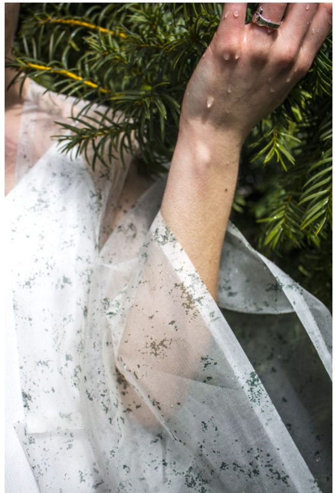
Figure 3. Biogarmentry (2019) by Roya Aghighi, is a living garment that combines natural fibre-based textile and living photosynthetic microalgae cells. (Image credits: Roya Aghighi).

Roya Aghighi's Biogarmentry (Aghighi, 2019) (Figure 3) represents a conceptual garment that amalgamates textiles derived from natural fibres with living photosynthetic microalgae cells. The designer envisions a lab-grown garment that is entirely composed of natural materials and possesses complete compostability, while