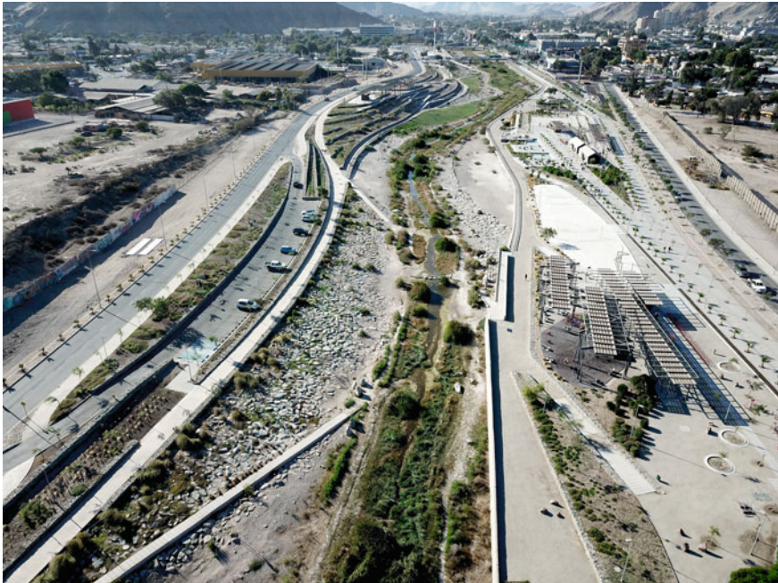
Fig. 7.3 Aerial view of Kaukari Urban Park in Copiapó city. (Tomás Gómez)