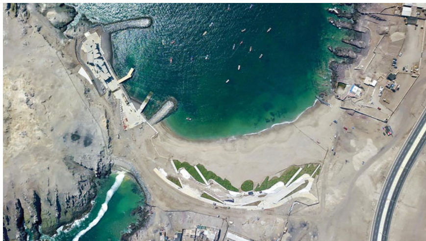
Fig. 7.4 Aerial view of Antofagasta Seaside Park in Antofagasta city. La Chimba artificial beach and fishing cove. (Nicolás Sepúlveda)

The first author of this chapter was involved partially in the two cases. We acknowledge such involvement could bring legitimacy issues but has enabled interviewees and access to data that would have been difficult otherwise. Likewise, the familiarity developed with the cities, the involved organizations, and the projects enabled valuable insights for this study (Labaree 2002).