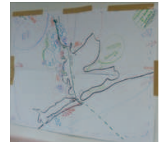
Figure 2. Map exercise at CIGAS Workshop October 2014, Texas, USA.

For the researchers, applying CIGAS in the Houston Galveston Bay situation provided further information on the usefulness of the approach. It yielded insights on how it can be adapted for eventual further use. Nevertheless, much remains to be done: for example, a follow-up workshop focusing more on functional engineering requirements to further explore potential flood risk strategy design based on the values and interests expressed by the local stakeholders in the CIGAS-Texas workshop.