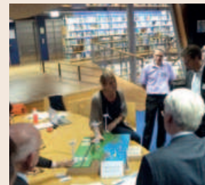
Figure 2. The 'MFFD- Decisions ' Lego® game in initial development stage.