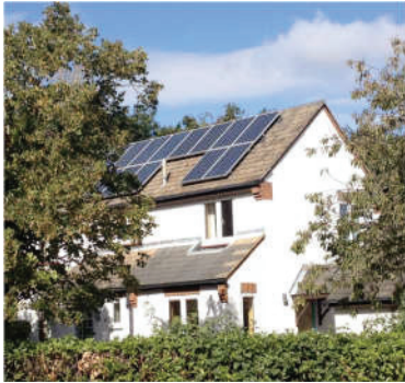
Figure 1: Energy sharing within a household