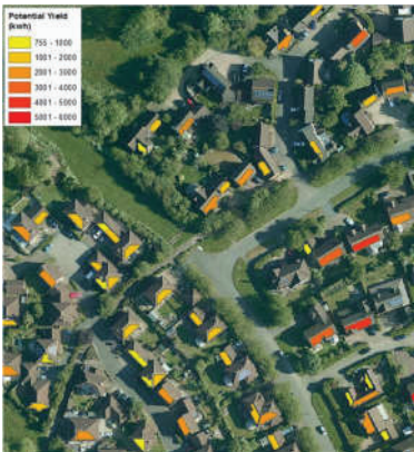
Figure 2: Aerial image data indicating potential yield from solar electricity potential

mechanisms make it possible to determine the availability and state of assets, and match demand and supply in real-time.