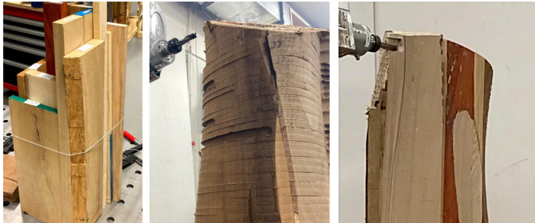
FIGURE 1 Packed, glued (left) and milled (middle and right) reclaimed wood boards serving as curvilinear beams for a larger structure.

D2RP efficiently links computational design with robotic production. It involves subtractive and additive techniques such as cutting and milling into materials such as plastic, wood, etc. and robotic 3D-printing with materials such as clay, plastic, etc., respectively (Bier, 2018; Bier et al., 2020). When equipped with various end-effectors robotic arms are versatile and in combination with Machine Learning (ML) models that accurately simulate the process and predict how processes evolve over time, and optimal settings can be identified (Peters et al., 2011) to optimize energy consumption and thereby reduce material use and processing time.