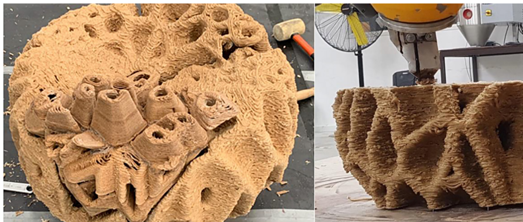
FIGURE 3 Wood-based polymer 3D-printed 'planetoid'.

Support-free 3D printing is achieved by controlling the angles of the Voronoi cells to be within the printing constraints that take into consideration the maximum achievable printing angle, which depends on the viscosity of the material at extrusion temperature as well as cooling i.e., crystallization speed. The printing angles are limited to 45-55 degrees in relation to the printing bed. Since the Voronoi-based cellular structure is an inherently stable self-supporting type of geometry, the cells can be printed at more extreme angles, while continuous toolpaths ensure that the printing process is efficient. The prototype was subdivided into multiple components, allowing the 'planetoid' to be printed in smaller parts. Based on this strategy larger objects are assembled from multiple components (Fig. 3). The size of the assembled object is thus not limited to the size of the 3D printing system. Also, easy transportation and assembly are accounted for.