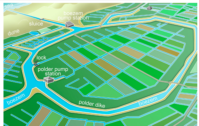
Fig. 1. Polder-boezem system

in proper management and, like all other inhabitants of the area, a vote in the election of a new board every four years. As a result, it is even more important than usual that employees directly involved in the day-to-day operation of the system understand and trust the tools they use. To paraphrase Lord Hewart’s famous statement on justice ([1924] 1 KB 256) “control systems must not only be reliable, but should manifestly and undoubtedly be seen to be reliable”. It is therefore necessary to demonstrate the reliability of a control system to experts in control theory, to experts in the field where the system is applied, and to the managers and operators of the system for which it is intended. While publication in the literature is the usual means of reaching the first two groups, for the managers