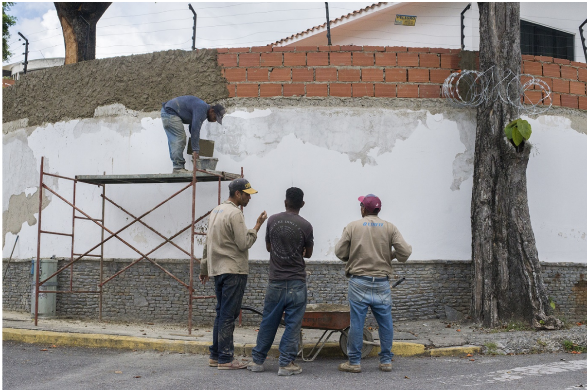
Figure 3. Construction of additional layers on existing perimeter wall.