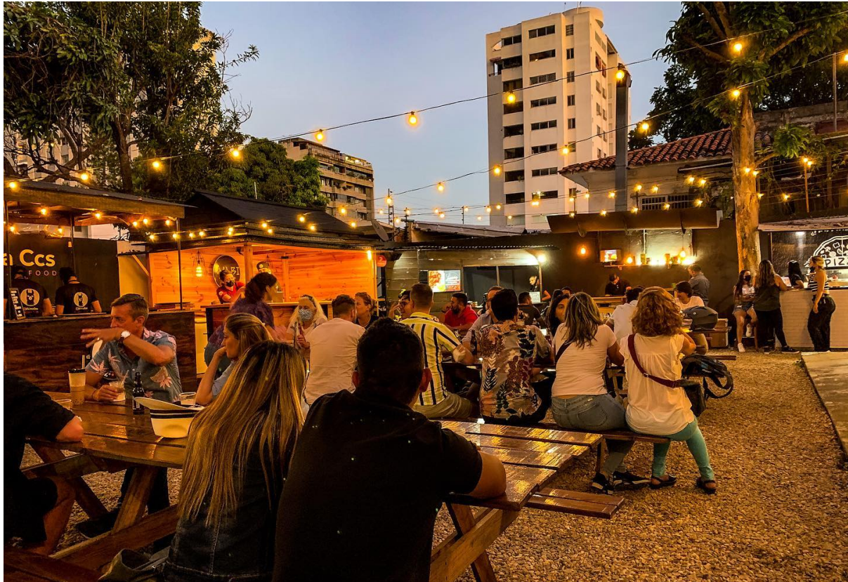
Figure 4: Outdoor area of Streat Market, Chacao.

with municipal authorities during construction. 'Permits are irrelevant. Regulating entities know what gets built, but due to their economic deficit, they look the other way in exchange for payoffs or other arrangements like paving a street or fixing street lights.' These entanglements and negotiations that shape professional illustrate what urban scholar Edgar Pieterse (2013) called the need to find ways of working together under opaque and fluid conditions.