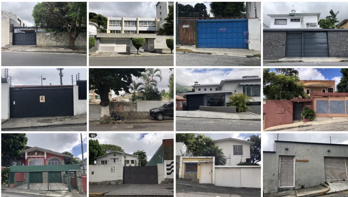
Figure 2. Recently converted homes. New uses are concealed behind tall walls and domestic exteriors.

Spatially, a salient feature of recent changes can be termed the ‘dual existence’ of commercial venues that operate out of domestic spaces. This duplicity is evident in the contradictory relationship these locations establish with the digital and physical public spheres, aimed at maximizing social media exposure while minimizing impact and interaction with the immediate surroundings. Businesses located in residential areas of Chacao have a vigorous digital engagement and can be easily located on platforms like Google Maps, increasing their visibility and accessibility. Simultaneously, they are concealed behind tall perimeter walls with little or no signage identifying them. However confounding this duality may seem, it does not respond to a need to evade authorities but to attract a specific clientele. It is common for these semi-clandestine establishments to advertise themselves in terms of isolation, refuge, or escape, a language directed ‘towards a new public who looks for privacy, exclusiveness, and luxury,’ according to María Christina Silva’s view (M. Silva, personal communication, November 11, 2022).