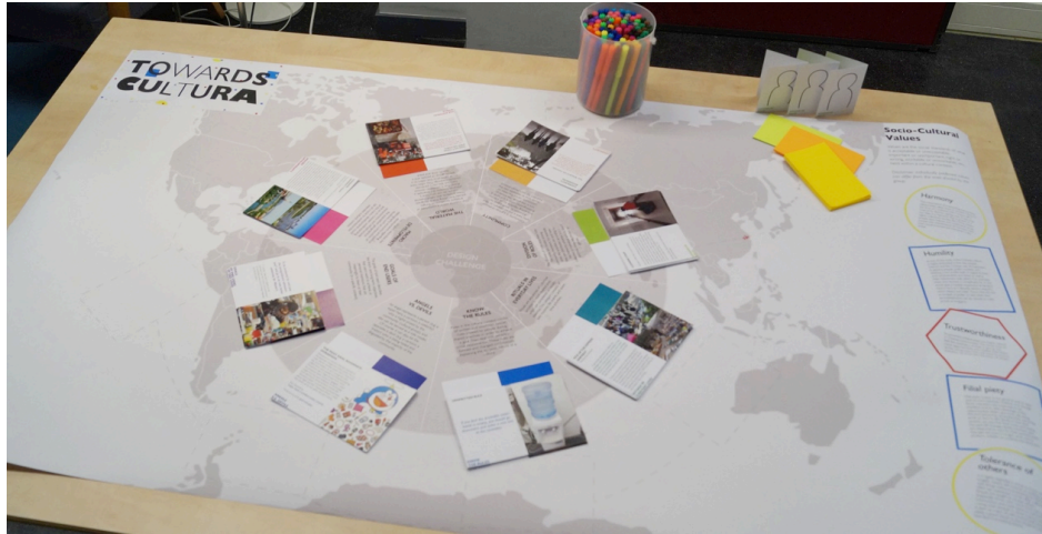
Figure 3. The insight cards are distributed on the Cultural wheel according to the 9 cultural aspects

The 72 UX insight examples were communicated in the format of cards, since they can be used flexible, spread out, studied individually, placed together, and shared among members in a design team (Beck, Obrist, Bernhaupt, & Tscheligi, 2008). Each example was categorized according to the nine cultural aspects (see the bottom-left corner of the cards in figure 4). Most of the insight cards included raw user experience data such as user quotes, images from the field as suggested by Sleeswijk Visser (2009). The other cards consisted of information from literature and desk research, especially for the aspects socio-cultural values and macro developments . Figures 3 illustrates how the insight cards were presented on the cultural wheel and Figure 4 gives examples of the cards. In addition, four video clips from participants in the data gathering study were selected.