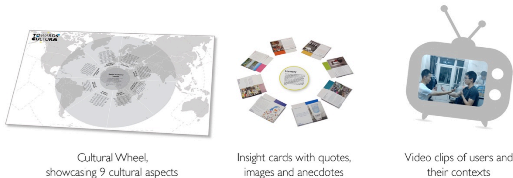
Figure 1. Overview of the tools in the Cultura toolkit (details in Figures 3 and 4)

toolkit includes two sets of data: (1) user data gathered specifically from the target group for the design topic at hand; (2) cultural information selected from theories to contextualize the user data.