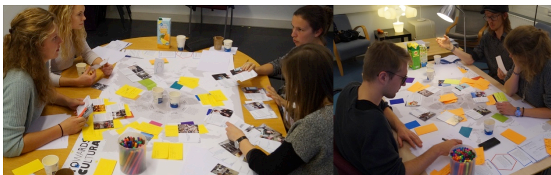
Figure 5. The designers using the toolkit in the design sessions

Cultural wheel provided designers a clear overview of what aspects can be considered when encountering an unknown cultural context. In the evaluation interview, one designer said the cultural wheel 'gives a clear overview'. He added, 'If you have an overview, I think it really helps your design and also speeds up the process, more importantly, coming up with richer ideas.' These aspects also helped the designers to structure, manage, and keep track of user information. As we observed during the sessions, all the designers used this structure to organize their post-its (notes) and to arrange the filtered insight cards (Figure 5). 'It helped us to make connections among all the aspects and based on the connections we develop an understanding about their situation,' explained a designer. Next to that, the designers were asked to reflect on the 9 cultural aspects specifically. Each of the aspects and their related cards were found to contribute to generate an overview of the intended cultural context: 'The connection between those aspects is really interesting for understanding the situations. I don't think an individual category will be enough to gain such understanding. I think we used a lot of connections between those.' This confirmed our confidence in not explicitly providing theory about the connections, but rather evoking them through the format of the toolkit.