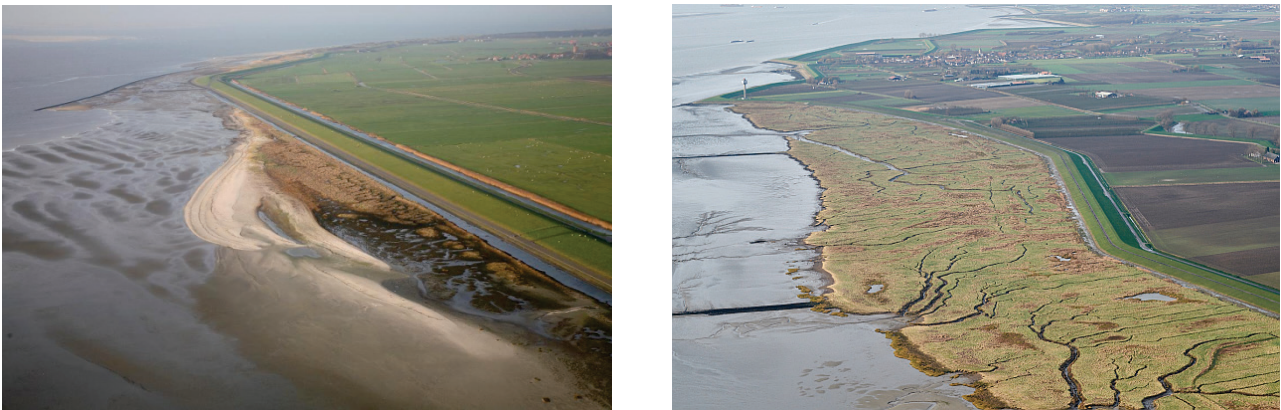
Figure 1 – Examples of salt marshes in the Wadden Sea (left) and Western Scheldt (right) in the Netherlands

Coastal flood risk reduction by creating and restoring ecosystems is increasingly seen as a promising supplement to conventional coastal engineering methods. Salt marshes, mangrove forests and reed fields can act as a vegetated foreshore in front of a coastal dike. In such a combined dike-foreshore system, the foreshore plays a role in attenuating storm waves, whereas the dike retains the surge and the remaining wave energy. The current study focuses on the process of wave attenuation by vegetation and, vice versa, the process of breakage of vegetation due to wave action.