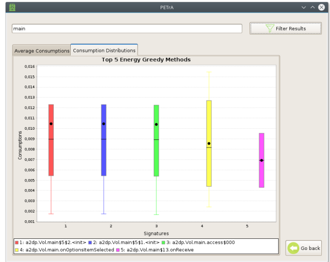
Fig. 3: PETrA: Results Plot View

Being a software-based approach, PETrA does not require any additional hardware equipment and, consequently, any