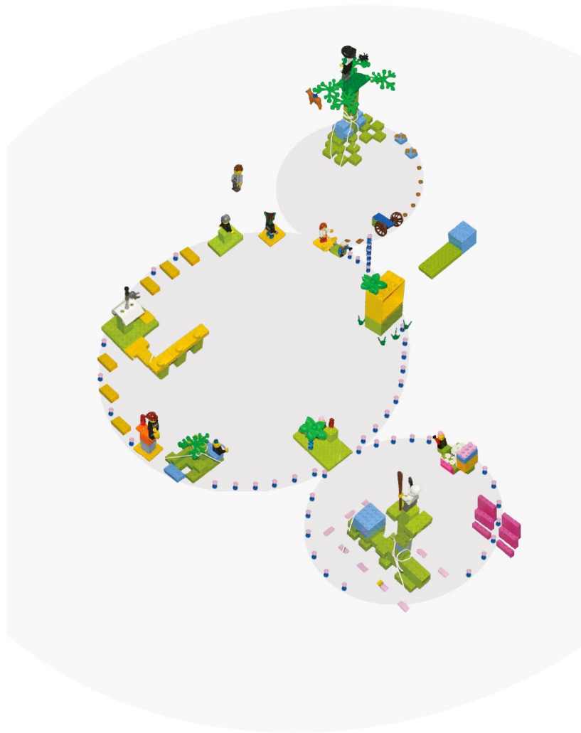
Figure 1: Digital collage of the results from two LEGO participatory mapping sessions. Case study participants designing an IPTV home-banking service used colour-coded LEGO bricks and figures to map the service infrastructure and the role of business actors. Two sessions are summarised here in a digital collage, showing the relationships that emerged. In the central loop, the service is carried forward, clockwise, starting with the client and moving to the provider and their business partners. Below, in a different loop, the banking platform assists cloud-based transactions made with a card. Above, the client receives income.

The satellite views for our navigation metaphor can be refined over time; in a second LEGO session, the group reflected upon and remodelled the weaker parts of the service design, adding bricks where necessary. The nature of actors was represented by avatars to show their business role, world view and degree of