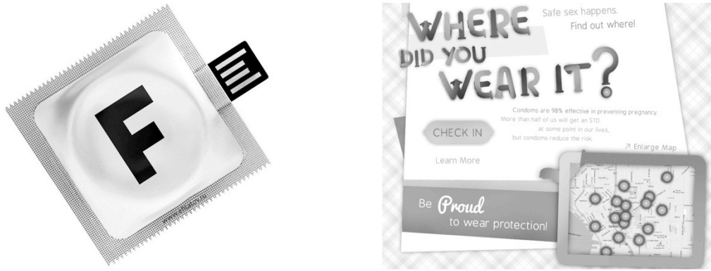
Figure 4 Condom USB by Evgeny Filatov and a snapshot from the website of ‘where did you wear it?’ by Planned Parenthood