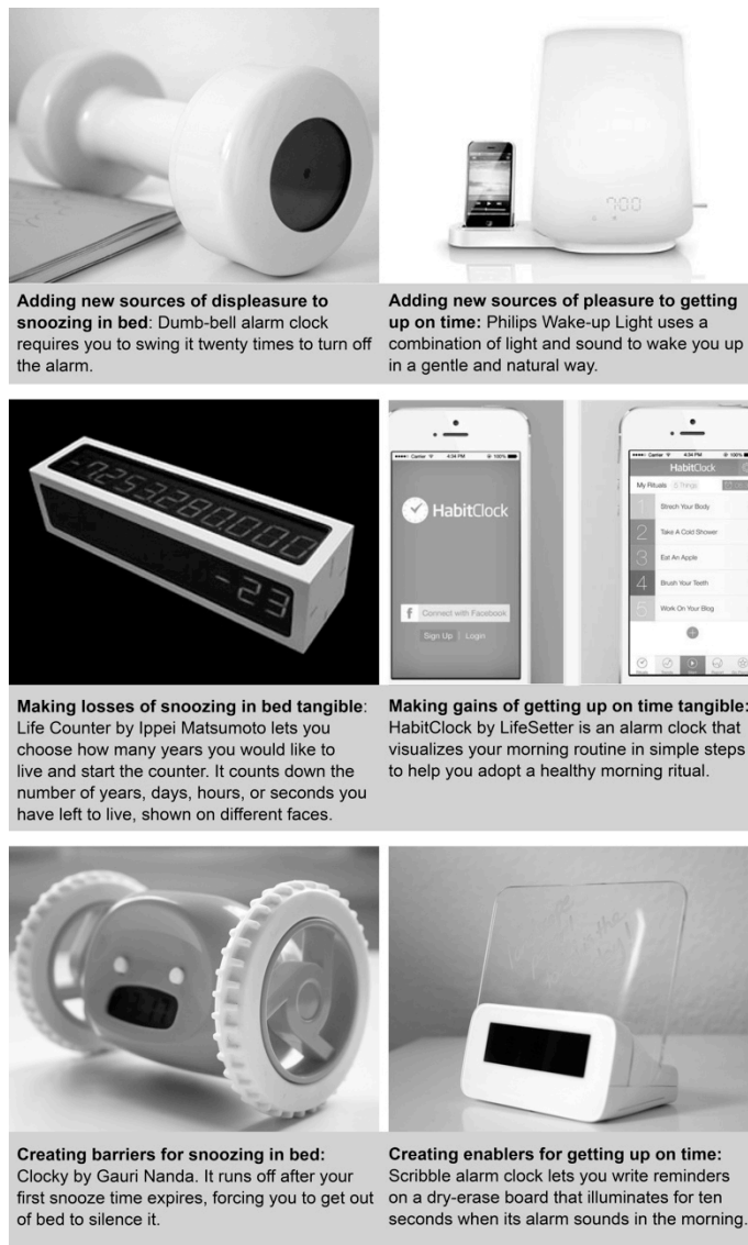
Figure 2 Product examples that align with the proposed design strategies and that can address the dilemma between lingering in bed and getting up on time