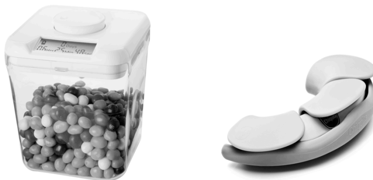
Figure 5 KitchenSafe by David Krippendorf and ChiquiSafe by David Dos Santos

In addition, KitchenSafe (Figure 5) is an appliance with a time-controlled lock mechanism, which, for a desired amount of time, prevents access to tempting food (e.g., candy). In this way, it creates a barrier to indulging in sweet snacks. Similarly, ChiquiSafe (Figure 5) is a banana holder that can act as a cue for eating fruit as a healthy snack. In this way, it creates an enabler for maintaining a healthy diet.