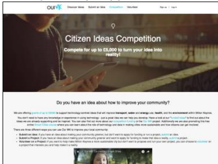
Figure 3. The competition page of the Our MK website

The first stage of the initiative involved soliciting citizens' ideas for how to change their community. To help achieve this, we developed a web-based platform to crowdsource citizens' ideas about sustainability issues in their community. For some people this is where their involvement ended. For others, they decided to complete stage two of the initiative, which helped turn their idea into a project . This involved entering the funding competition, completing an application form outlining the project concept, a budget (up to £5,000) and any technical, commercial or community support needed to make their project a success.