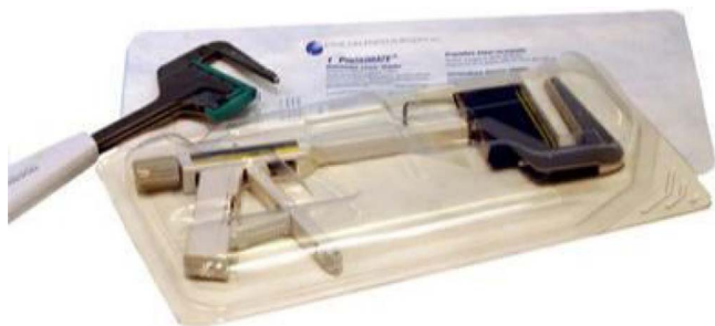
Fig. 1. Sterile packaged single-use surgical stapler.

This policy stance suggests that though in practice recovery of SUDs is indeed widespread, there is no legal motivation for an OEM to design a device for easier sterilization, unless they want to incur the extra costs required to label it ‘reusable’, which include performing their own in-house sterilization validation, detailed sterilization instructions and taking on responsibility for the success of sterilization (US Center for Devices and Radiological Health, 2015). Indeed, since most reprocessing is performed by third-parties and in theory reduces sales of new equipment, it may be in the business interests of most OEMs to discourage devices from being reused. Information exists showing that recovery is sometimes actively discouraged through design, with several patents in existence for SUDs that “self-destruct” after a single use (Moduga, 2010; Burnside, 2003; OuYang et al., 2011; Ross and Zemlok, 2011).