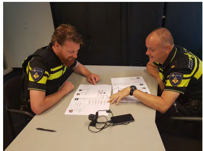
Figure 2: Expert deliberations during test in Groningen.

The application was tested using three different versions, altering the way AR elements and information was displayed (see Figure 1). Version one augments all necessary information on a panel anchored to the POI. This means that while the rotation on the z-axis adjusts to face the user (to make it readable from all angles), the panel transforms according to the distance and position of the camera to augment it in a fixed position. In version two the panel is displayed as a two-dimensional interface element, i.e. it is not augmented in three dimensional space. All other components, including the spatial identification aids, remain constant to version one. The third version was designed to minimize textual information as much as possible